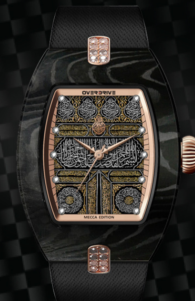
MECCA EDITION LADYS

3D PRINT DIAL SWAROVSKI STONES 1 BIG ON CROWN 16 STRAP LUG - 10 ON DIAL DAMASCUS CARBON FIBER BLACK SATINE STRAP WICH GOLD BUCKLE GOLD CROWN